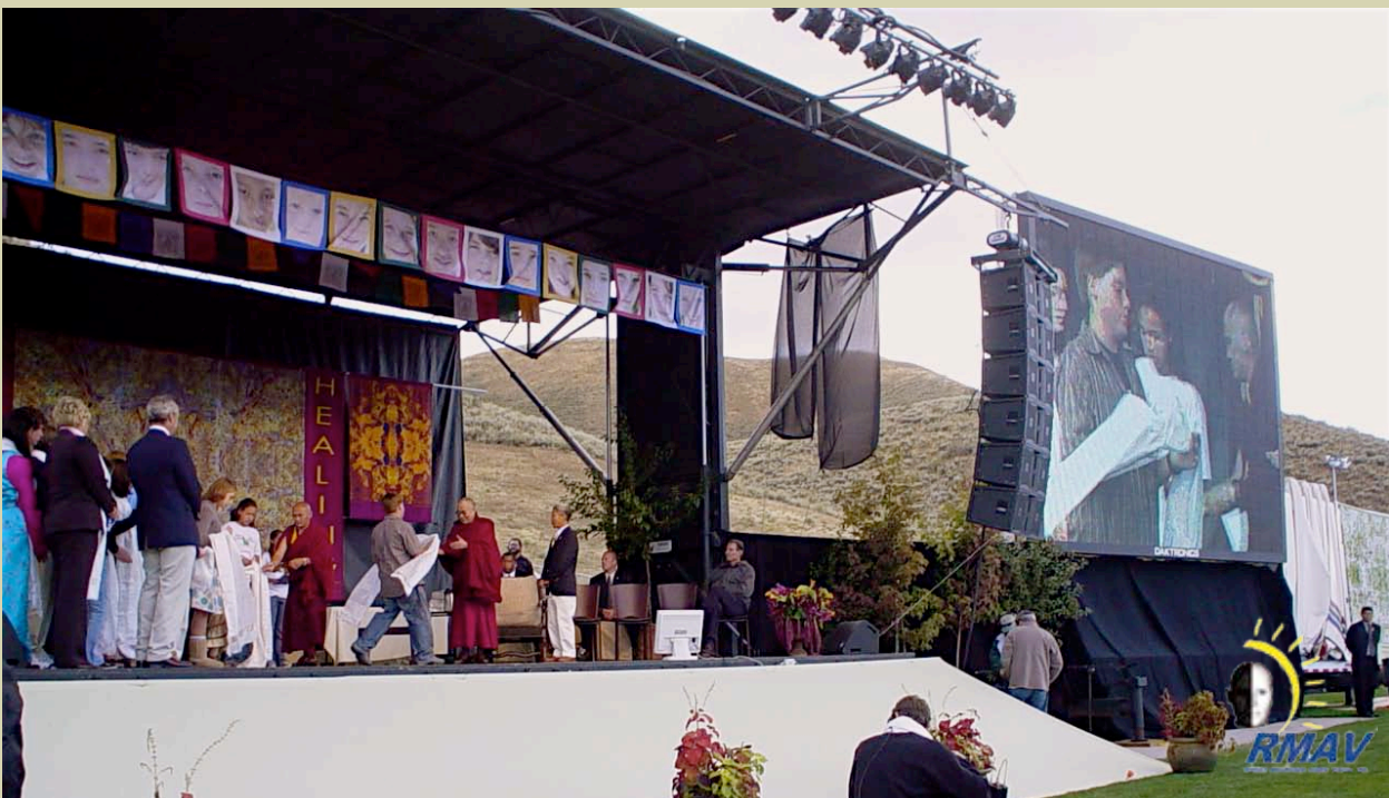
Stageline SL250 Stagevan with Vertec speakers and LED video screen